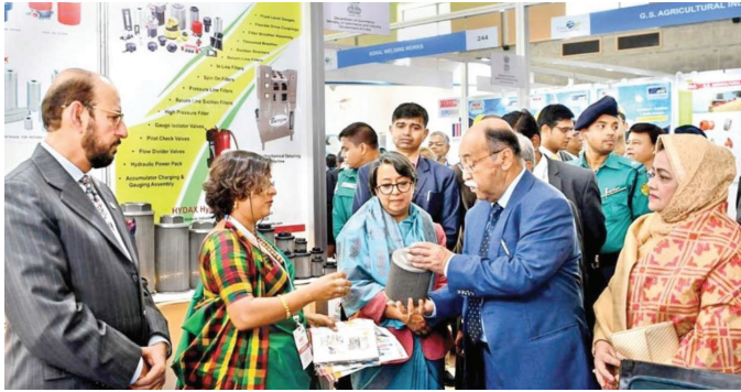
Industries Minister Nurul Majid Mahmud Humayun visiting a stall after inaugurating the INDEE Bangladesh 2020 at ICCB

A three-day trade show on Indian engineering products kicked off in the city on 23rd January aimed at forging global supply chain with partners from the two neighboring countries.