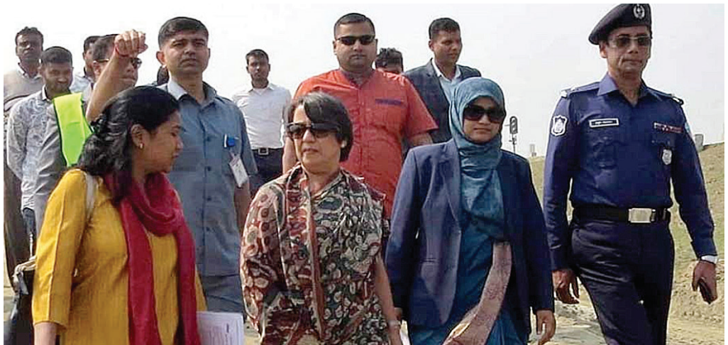
Indian High Commissioner to Bangladesh Riva Ganguly Das visiting the construction work of the Akhaura-Agartala rail line in Akhaura of Brahmanbaria on Thursday. -AA

It is mentionable that the 15-kilometre Akhaura-Agartala rail project will cost Tk 477 crore. Bangladesh Prime Minister Sheikh Hasina and her Indian counterpart Narendra Modi inaugurated the project through video conference on September 10, 2018. (Courtesy: The Asian Age; Dated: February 14, 2020)