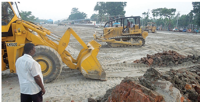
Work is going on in full swing to construct the rail track from Nilphamari's Chilahati station to the Indian border as the authorities concerned are expecting inauguration of the third direct train communication with the neighbouring country by July this year.

The third direct train connection with neighbouring India, through bordering Chilahati station in Nilphamari, is likely to start in July this year as half