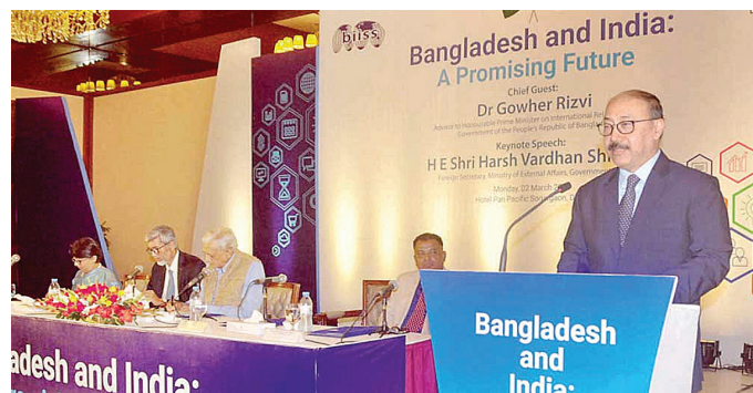
Indian Foreign Secretary Harsh Vardhan Shringla addresses a seminar on Bangladesh-India relations in Dhaka on Monday, March 2

Prime Minister's International Affairs Adviser Dr