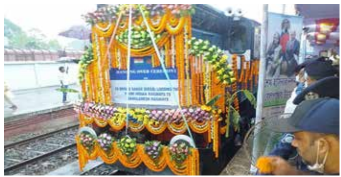
ands over the locomotives as grants through Darshana-Gede Interchange

Bangladesh has received 10 locomotives from India as grant to facilitate its broad gauge passenger carriage and cargo movement in line with growing demand of the services.