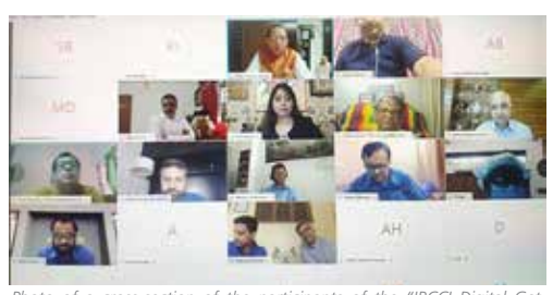
Photo of a cross-section of the participants of the "IBCCI Digital Get