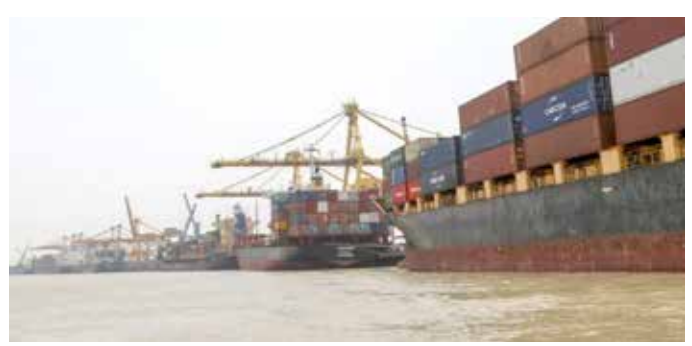
Inland waterways development between Bangladesh and India can become a vital and cost-effective way of multimodal connectivity that can improve the economic wellbeing of people from both countries, policymakers and experts have said.

which is also a prerequisite for agricultural growth, they said at the inaugural webinar of Asian Confluence NADI conversations organised by Asian Confluence, a premier Indian think tank based in Shillong on Wednesday.