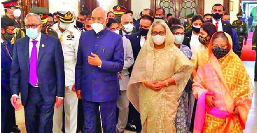
Visiting Indian President Ram Nath Kovind on Wednesday expressed his eagerness to increase the existing trade and business ties with Bangladesh through joint-efforts as he paid courtesy call on his Bangladeshi counterpart M Abdul Hamid at Bangabhaban in the capital in the evening.

He praised the participation of Bangladesh contingents at the Indian National Day march-past event and subsequently the Indian contingents' members at the Bangladesh Victory Day's program in Dhaka.