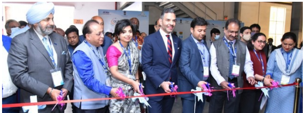
While the EV Summit and Exhibition showcased the industry capabilities in new-age industry, ATPSE and i-Auto Connect displayed the industry's technical and export strengths

Summit and Expo (ATPSE) and i-Auto Connect, ACMA's flagship reverse buyers and sellers meet. The two-day extravaganza was held on March 23 and 24, 2022 at the Greater Noida Expo Centre. The