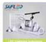
LED Lighting Technology