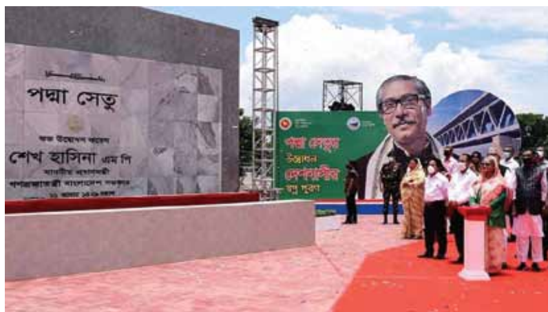
Prime Minister Sheikh Hasina inaugurating the much-anticipated Padma Bridge for traffic movement in Saturday - PID Photo

Courtesy: The Financial Express, Dated June 26, 2022.