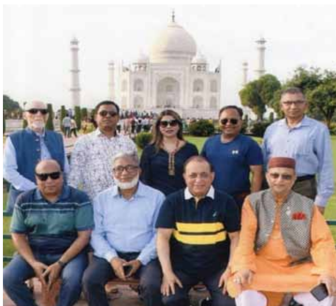
IBCCI Delegation visits the historic Taj Mahal on 22nd August 2022