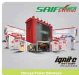
Storage Power Substation