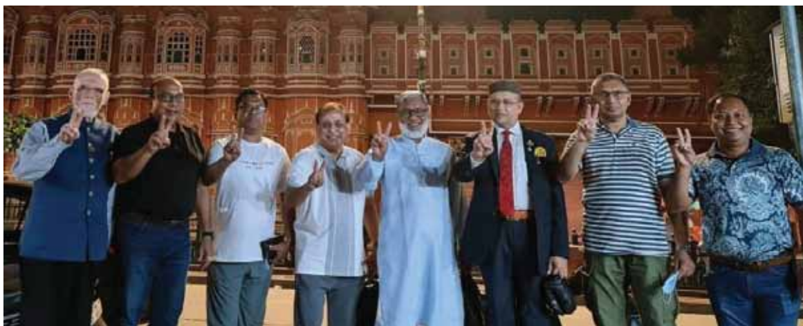
IBCCI Delegation Team is on a visit at the Pink city, Jaipur, Rajasthan.