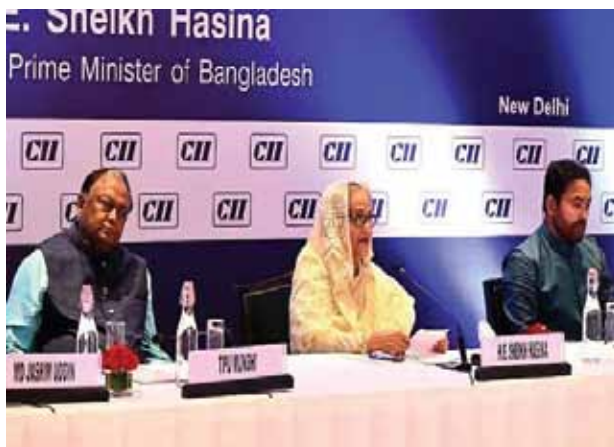
Prime minister Sheikh Hasina addresses a high level business event jointly organised by the FBCCI and Confederation of Indian Industry at the Ballroom of her palace of residence in New Delhi on 7 September 2022

"It should include investment, finance, services, technology transfer, and be placed within the context of regional cooperation," she said.