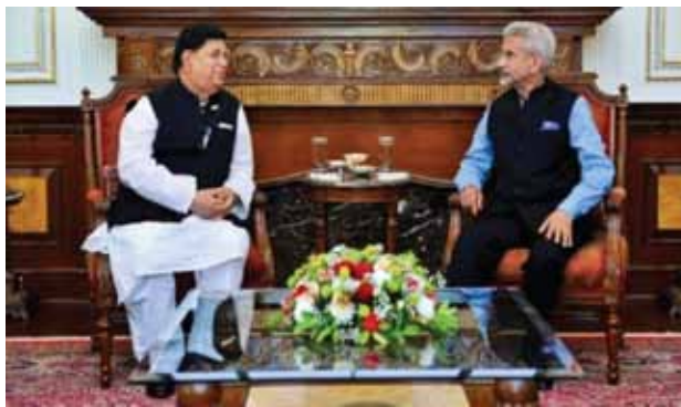
Bangladesh Foreign Minister Dr AK Abdul Momen meets with External Affairs Minister S Jaishankar at the 7th India-Bangladesh Joint Consultative Commission (JCC) meeting in New Delhi on Sunday, June 19, 2022.

In his opening remarks, Jaishankar said India looked forward to working with Bangladesh to take bilateral ties to new domains – Artificial Intelligence, cyber security, startups and Fintech. He said the two countries also need to work together comprehensive management and conservation of 54 common rivers as well as the shared environmental responsibility that we have, especially the Sundarbans.