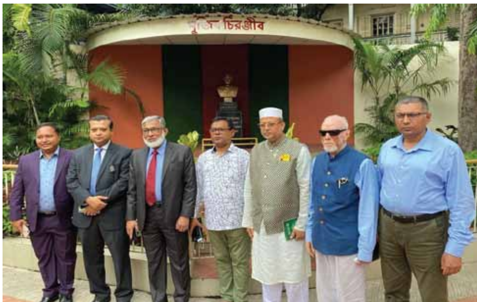
IBCCI Delegation is at the Bangladesh Deputy High Commission in Kolkata.