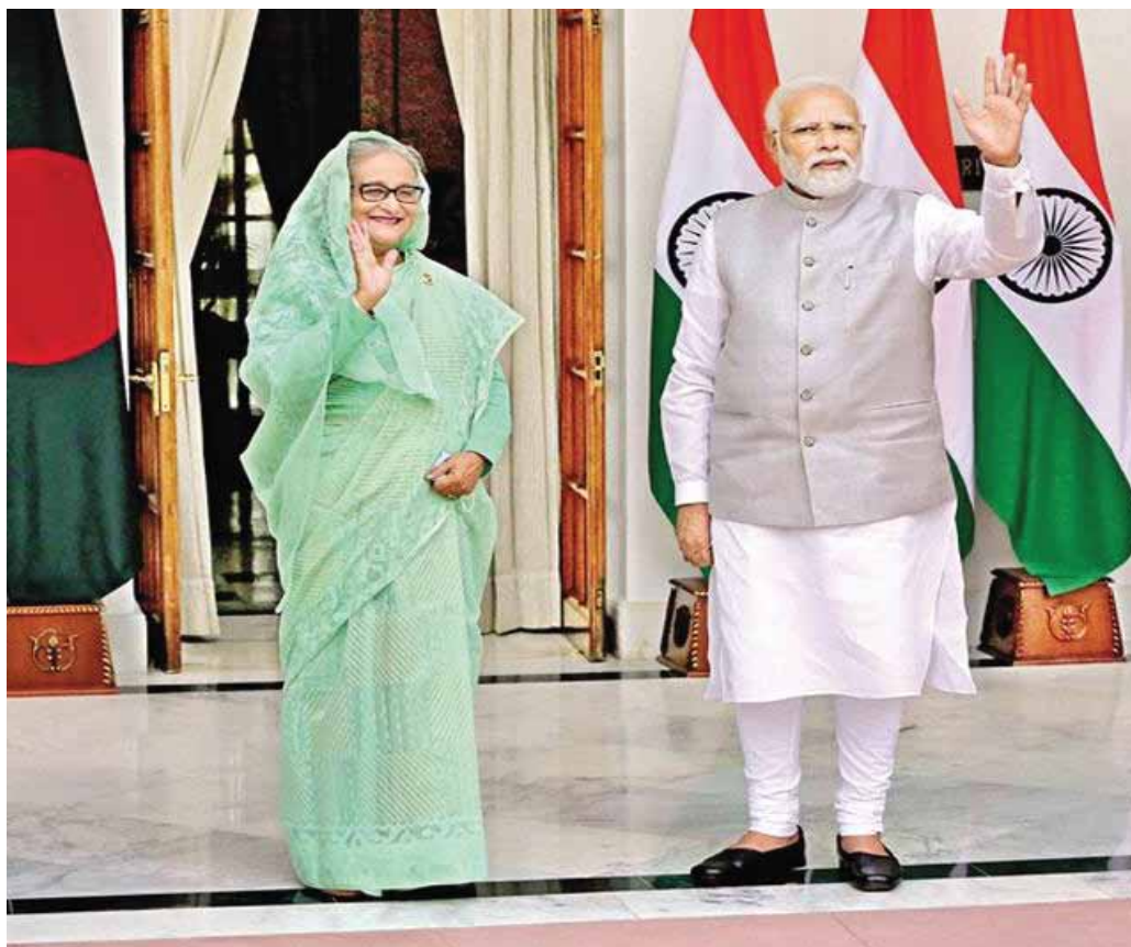
Bangladesh Prime Minister Sheikh Hasina and her Indian counterpart Narendra Modi pose for a photo after her arrival at the Hyderabad House in Delhi on Tuesday

Prime Minister Sheikh Hasina and her Indian counterpart Narendra Modi witnessed signing of the bilateral instruments after holding bilateral talks at Hyderabad House in India's capital city as the two countries seek enhanced cooperation. Issues related to security cooperation, investment, enhanced trade relations, power and energy sector cooperation, water sharing of common rivers, water resources management, border management, combating drug smuggling and human trafficking will get priority during the talks between PM Hasina and her Indian counterpart Modi, officials said.