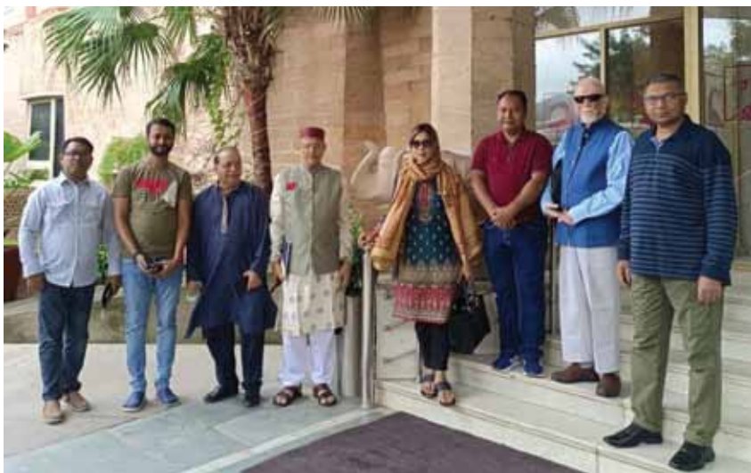
IBCCI Delegation in a business and investment networking visit at the Hotel Mansingh Palace in Ajmer on 24th August 2022