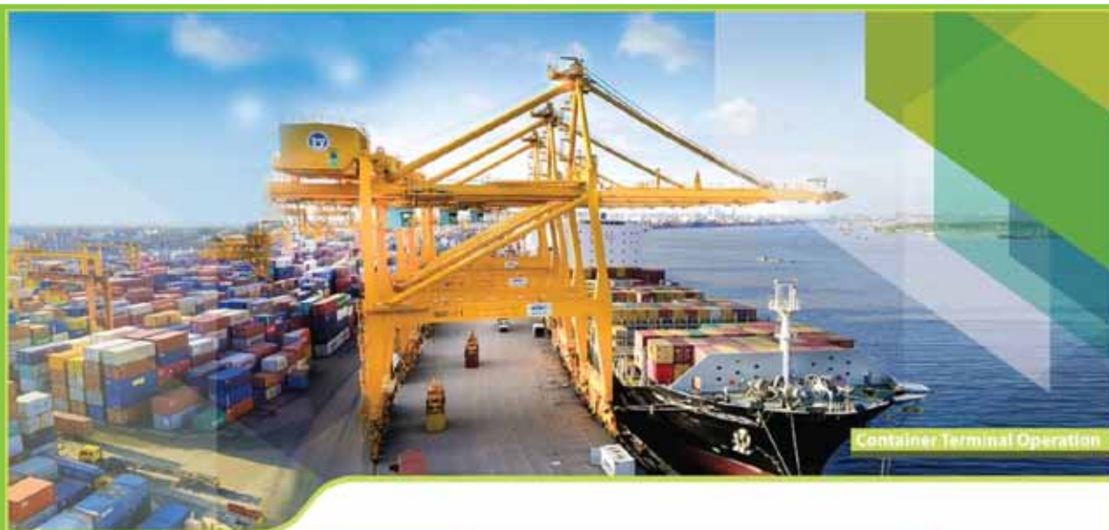
Container Terminal Operation