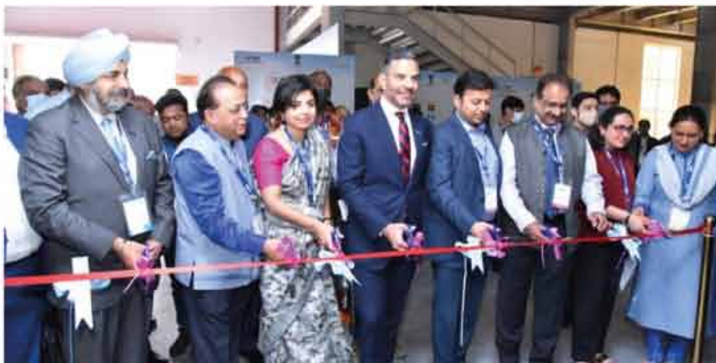
Cutting of ribbon at the opening ceremony of the Auto Technology Partnership Summit and Expo held on March 23 and 24, 2022 at the Greater Noida Expo Centre.