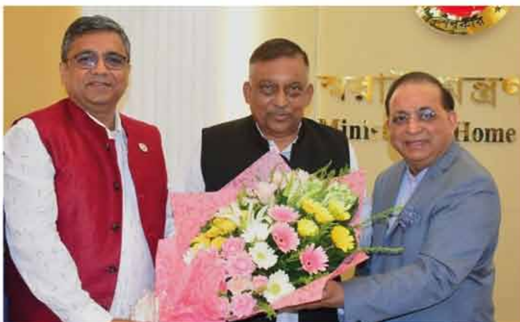
Leaders of India-Bangladesh Chamber of Commerce and Industry (IBCCI) had a meeting with Home Minister Asaduzzaman Khan Kamal on Monday at the Secretariat. The IBCCI leaders greeted the Home Minister with flowers.