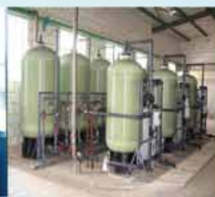
Water Treatment Plant