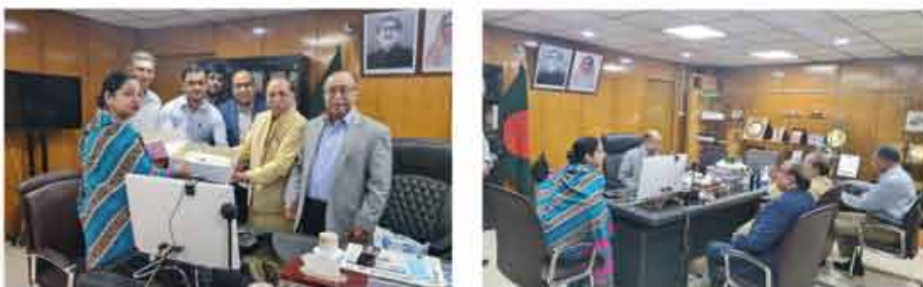
IBCCI business delegation made a call on with the honorable Minister, Ministry of Industries Mr. Nurul Majid Mahmud Humayun, regarding the promotion of trade and business between Bangladesh and India and the upcoming visit of SIAM/ACMA delegates to Bangladesh on 26th October 2022.