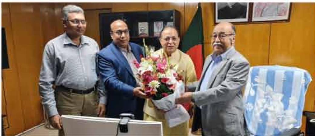
IBCCI business delegation is on a call on with the honorable Minister, Ministry of Industries regarding the upcoming visit of ACMA delegates to Bangladesh on 26th October 2022.