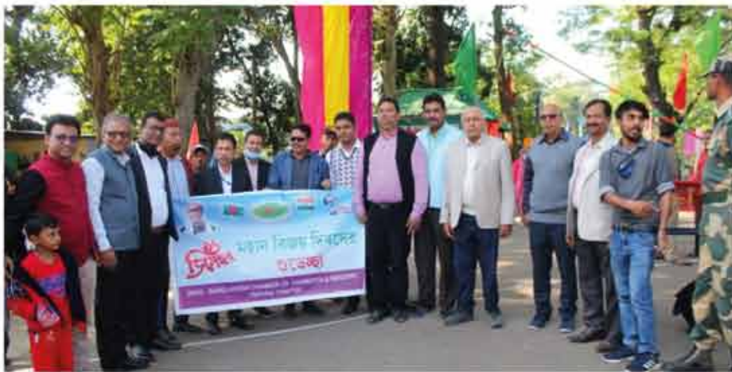
Bangladesh independent day is being celebrated by IBCCI Tripura Chapter.