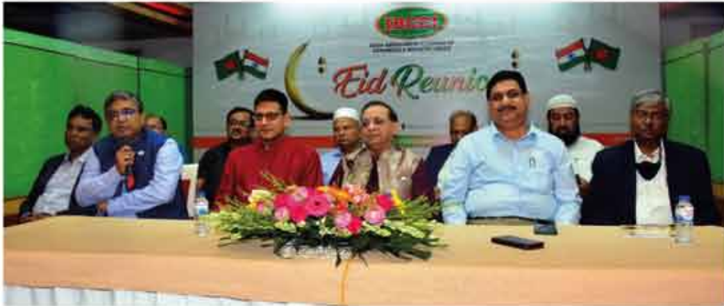
Eid Reunion 2022