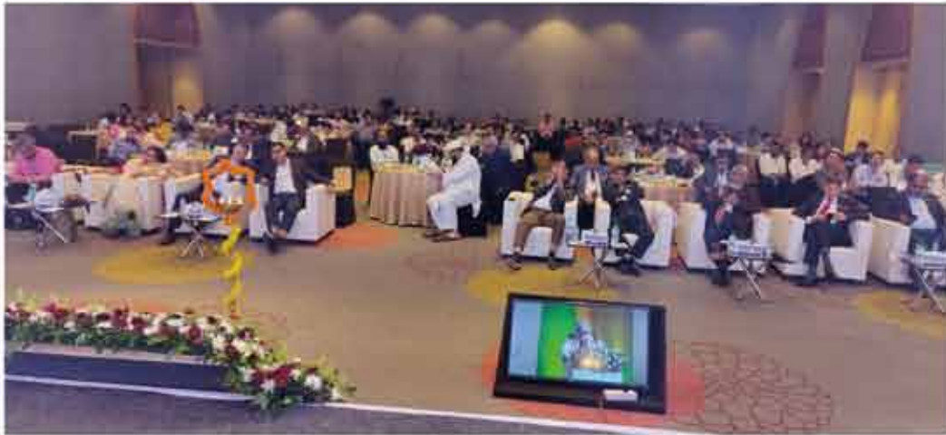
A cross section of the audience of the innagural ceremony of 2-days India-Bangladesh Buyer Seller Meet 2022 held at hotel Taj Vivanta, Guwahati, Assam on 19th October 2022.