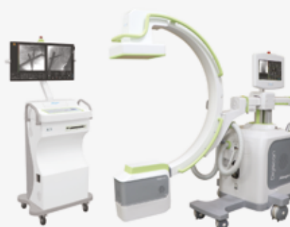
C-Arm X-Ray Machine