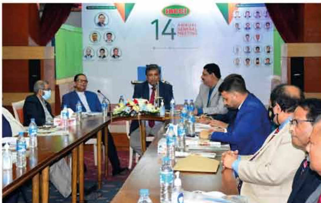
A cross-section of the 14th AGM (Hybrid Mode) held on 30 December 2021.