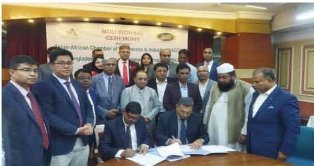
MOU Signing Ceremony between the Asian-African Chamber of Commerce and Industry (AACCI) and India-Bangladesh Chamber of Commerce and Industry (IBCCI) on 27 November 2022 at the Nitol Niloy Centre, 71, Mohakhali C.A, Dhaka-1212.