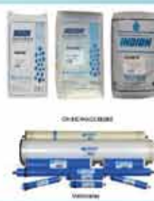
INDION Resins & Membranes