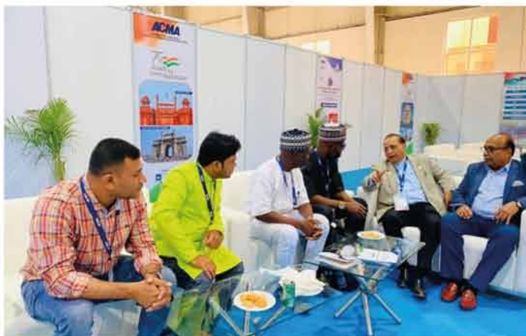
IBCCI business delegation is on a B2B meeting with the African delegates at the Auto Technology Partnership Summit and Expo held on March 23 and 24, 2022 at the Greater Noida Expo Centre.