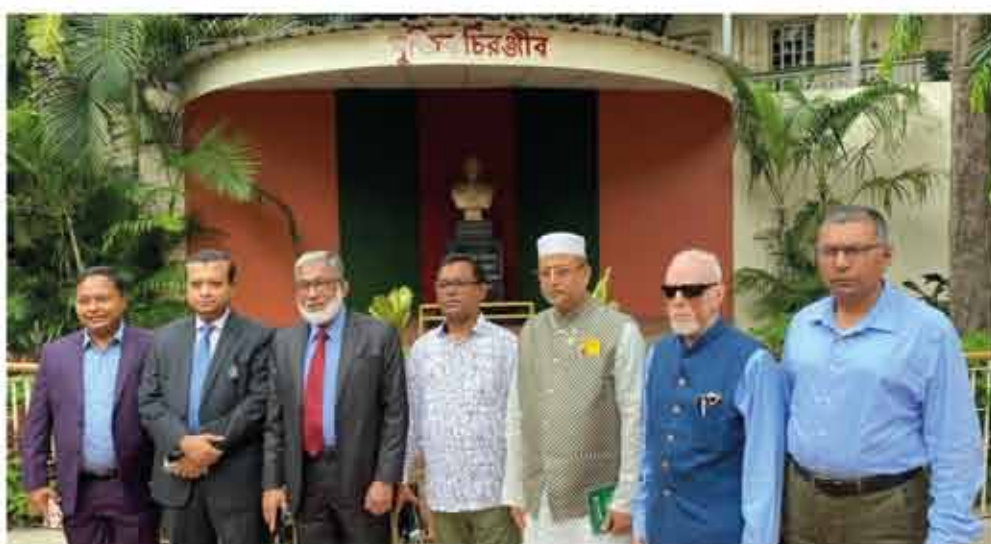
IBCCI Delegation is at the Bangladesh Deputy High Commission in Kolkata.