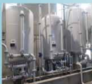
Iron Removal Plant