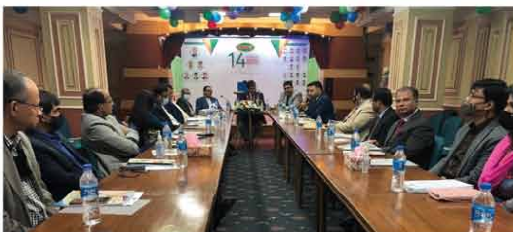
A partial view of the 14th AGM