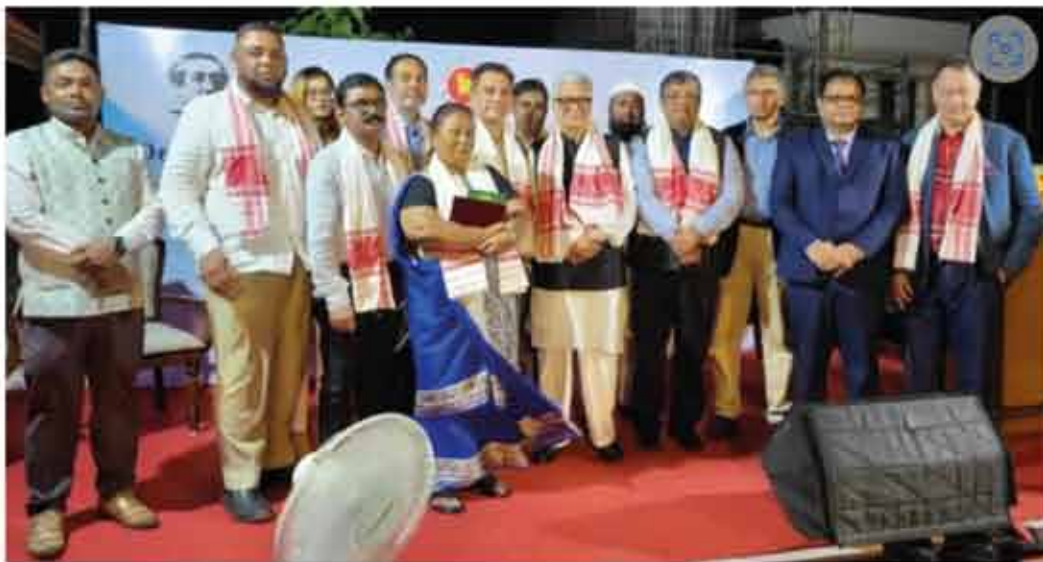
Launching of IBCCI Assam Chapter at the Assistant High Commission of Bangladesh in Guwahati on 19th October 2022