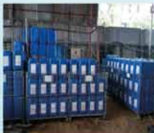
INDION Chemicals (Boiler, Cooling Tower & RO)