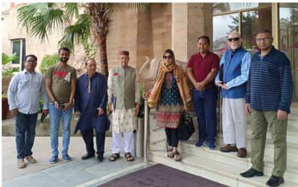
IBCCI Delegation in a business and investment networking visit at the Hotel Mansingh Palace in Ajmer on 24th August 2022