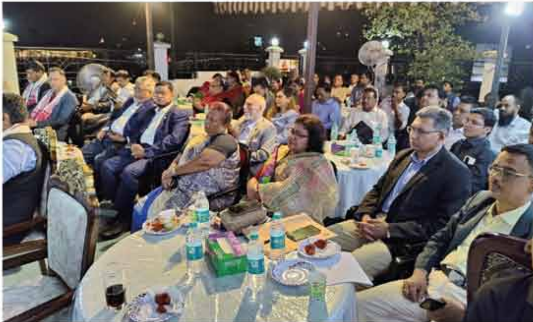
A cross section of the audience of the launching ceremony of IBCCI Assam Chapter at the Assistant High Commission office, Guwahati Assam on 19th October 2022 evening.