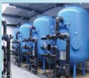
Iron Removal Plant