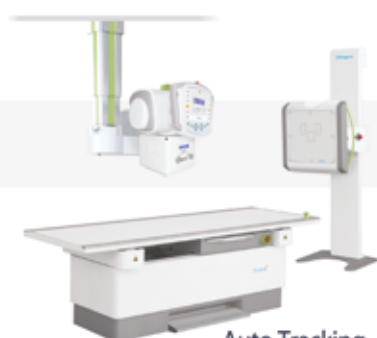
Auto Tracking Digital X-Ray Machine

Mashruba Medical Technologies is leading towards future, maintaining quality services and being persistent game changer in health sector of Bangladesh.