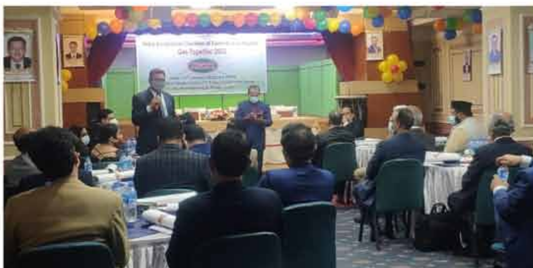
At the IBCCI Get-Together 2022.