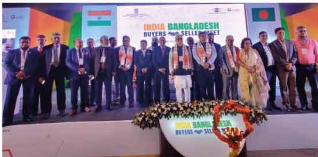
Bangladesh Delegates are seen with the guest of the opening ceremony at the dias of India Bangladesh Buyer Seller Meet 2022, Guwahati, Assam.