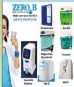
Drinking Water Purifiers