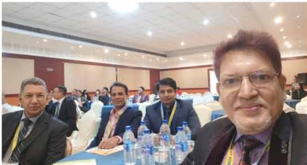
IBCCI delegates at the One Day International Business Summit, 2022 "Gateway Manipur-Connecting ASEAN Countries" on 24th November 2022 at Sangai Hall, Hotel Imphal by the Classic.