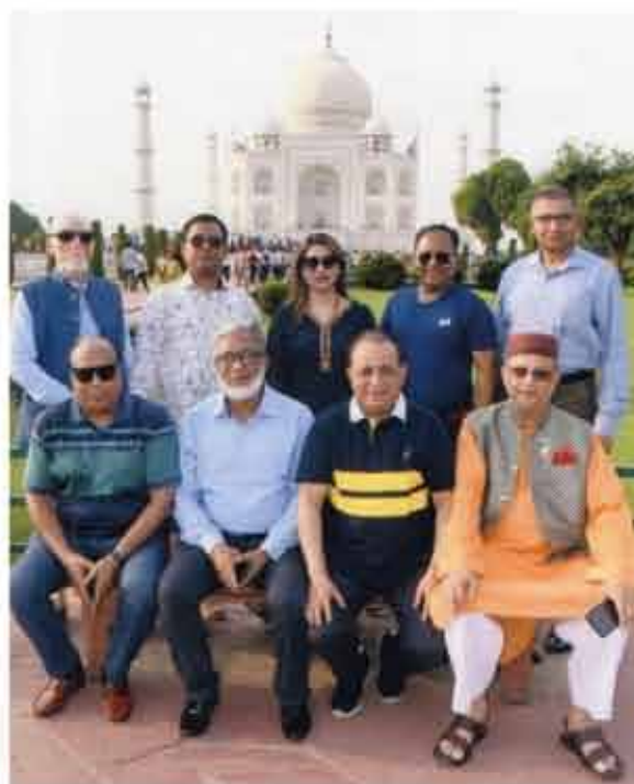
IBCCI Delegation in a business and investment networking visit at the historic Taj Mahal on 22nd August 2022