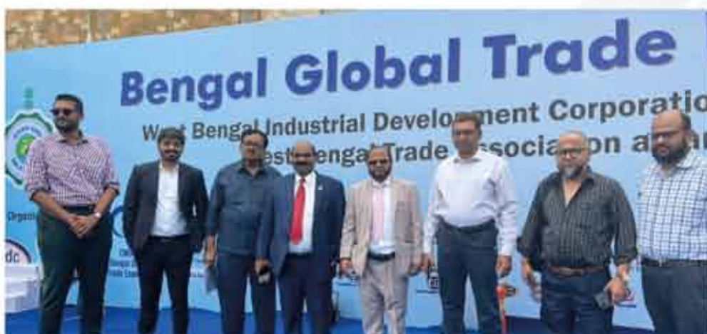
IBCCI business delegates is at the Bengal Global Expo 2022 at the Science City, Kolkata.