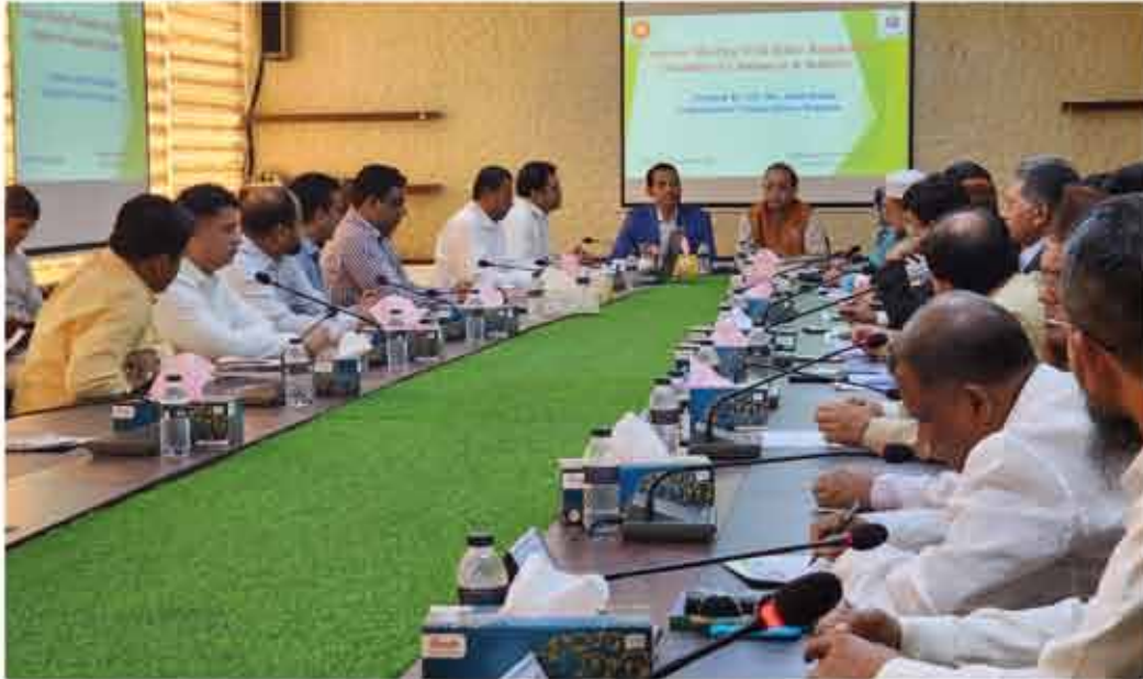
A cross section of the audience of the discussion meeting on the development of Benapole Petrapole land port infrastructure at the Custom House, Benapole on 3rd November 2022