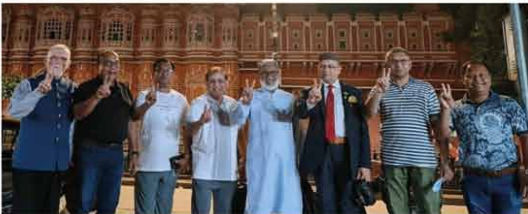
IBCCI Delegation Team is on a visit at the Pink city, Jaipur, Rajasthan.