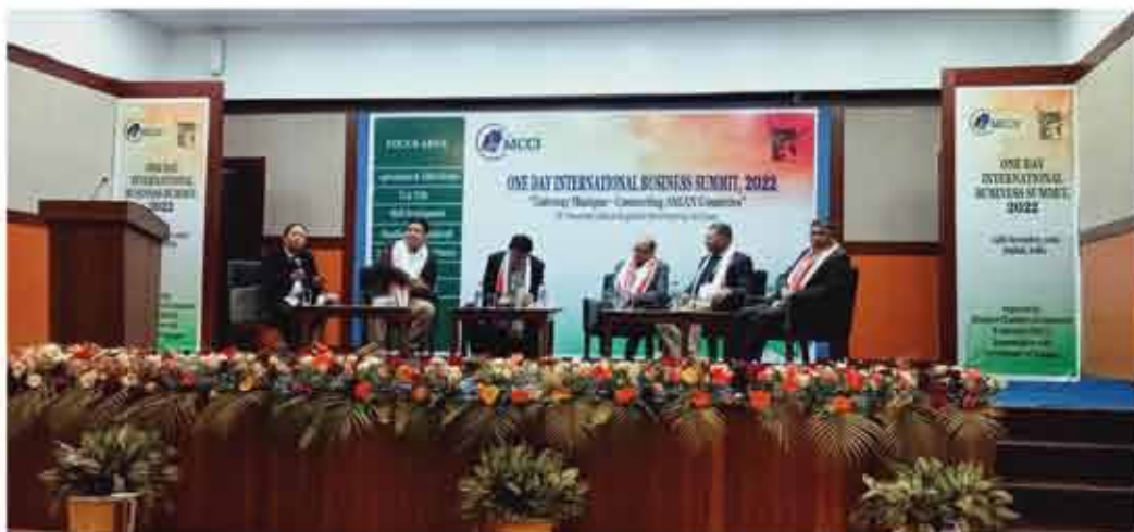
IBCCI Secretary General is at the Technical Session on Agriculture, Food Processing, Handloom and Handicraft, Textiles, and RMG at One Day International Business Summit, 2022 "Gateway Manipur-Connecting ASEAN Countries"