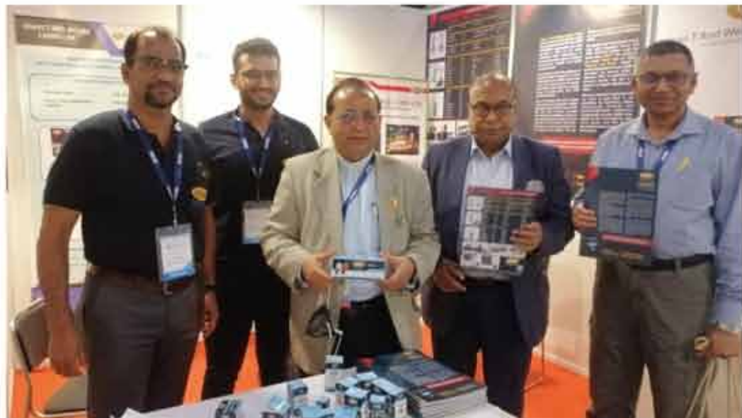
The Automotive Component Manufacturers Association of India (ACMA) successfully concluded three concurrent events – the ACMA EV Summit and Exhibition.