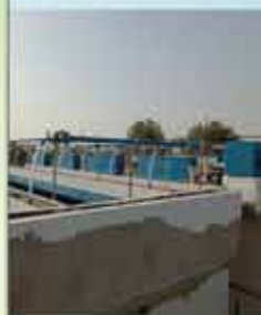
UASB for Rice Mill