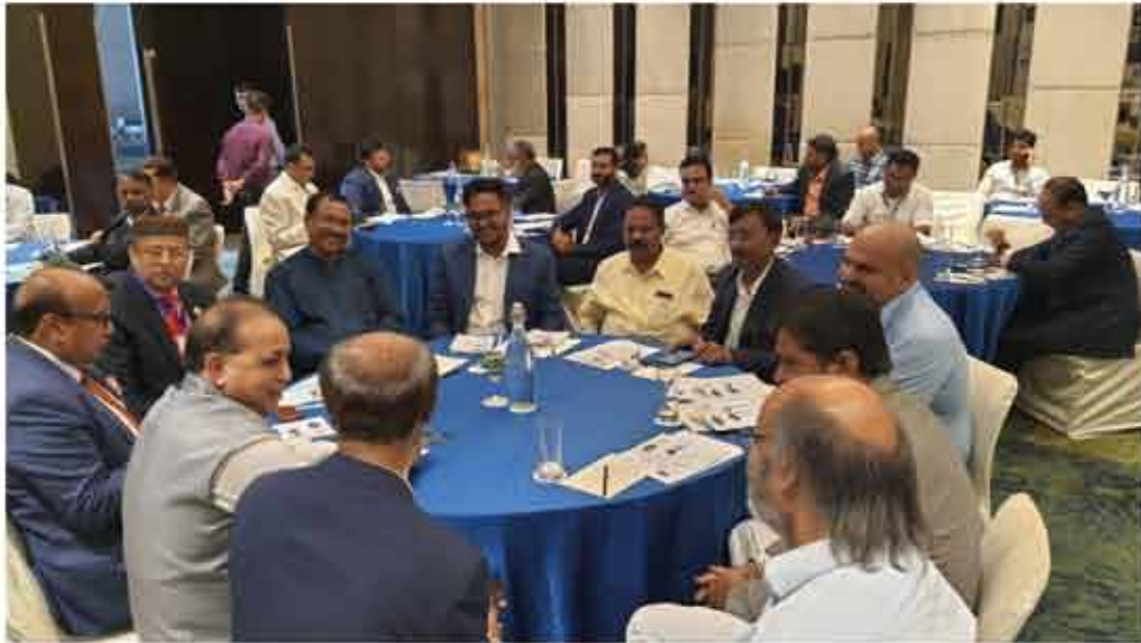
A cross-section of B2B meeting at Jaipur