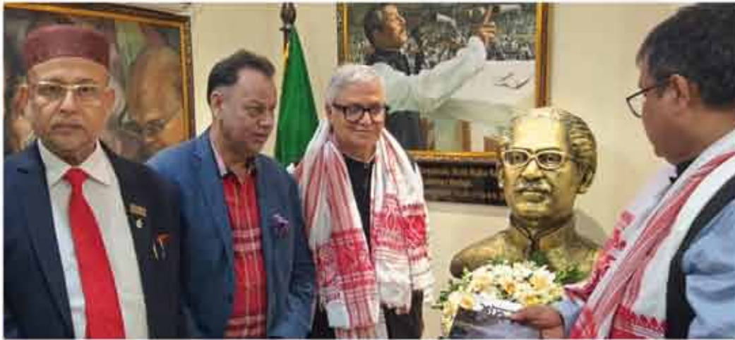
In the evening delegates from Bangladesh placed a wreath at the mural of the Father of the nation at the Guwahati High Commission Office.