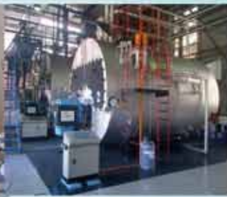
Boiler Water Treatment