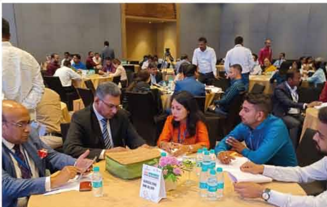
A cross-section of B2B meeting at Guwahati, Assam