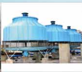
Cooling Water Treatment