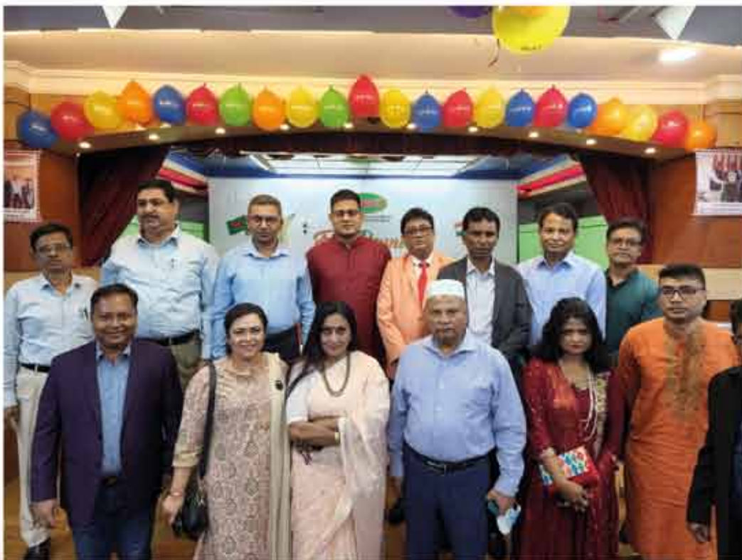
Eid Reunion 2022