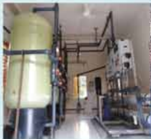
WTP with RO