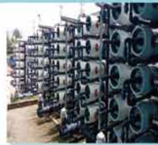
Reverse Osmosis Plant