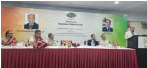
Photo: The Hon'ble Minister, Ministry of Industries Mr. Nurul Majid Mahmud Humayun MP is speaking at the seminar.