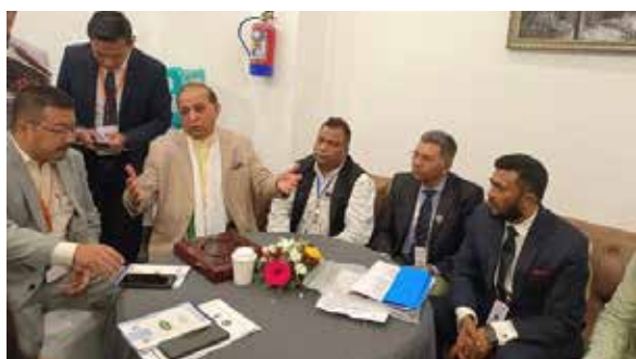
Photo: Discussion with the Business Association of Nagas on 5 April 2023 at the state Banquet hall, Kohima