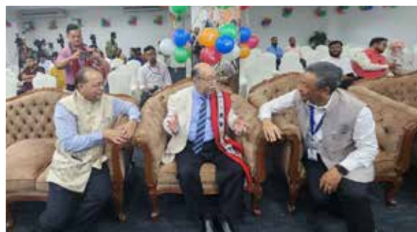
Photo: The Leader of Nagaland Business Delegation is exchanging views with the Honorable Minister of Industries.