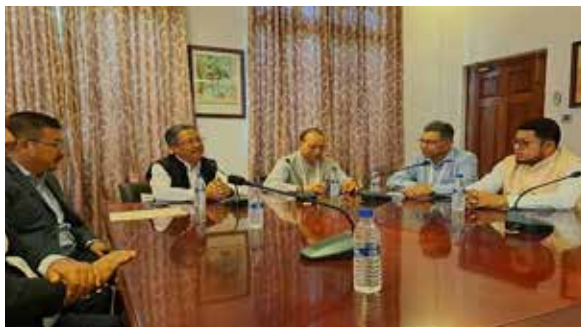
Photo: Meeting between IBCCI and BAN at the Niathu Resort in Kohima.