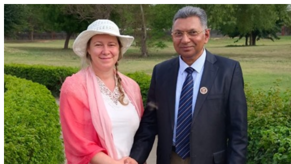
Photo: With a Canadian Diplomat at the Lotus Temple compound in New Delhi on 20 April 2023.