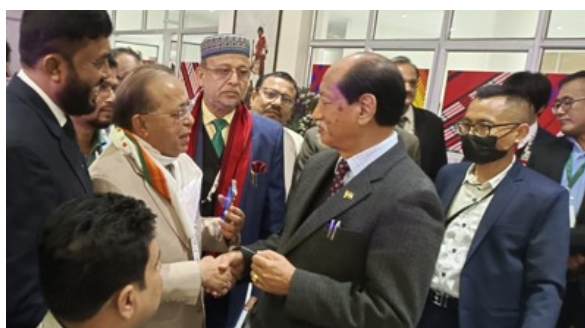
Photo: Interaction of IBCCI President with Honorable Chief Minister of Nagaland H E Shri Neiphiu Rio on 4th April 2023 at the dinner in Heritage, DC Bungalow.