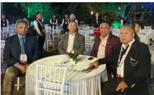
Secretary General of IBCCI with some panelists at the B20 India Initiatives in North East States of India 1-3 March 2023 at Aizawl, Mizoram.