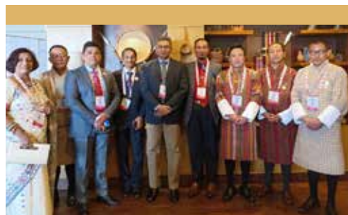
Secretary General of IBCCI with a cross section of foreign delegates at the B20 India Initiatives in North East States of India 1-3 March, 2023 at Aizawl, Mizoram.