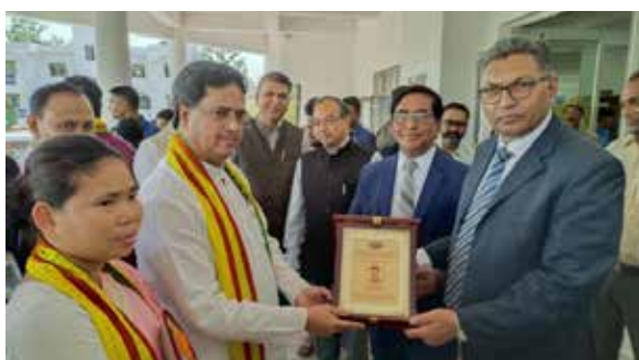
IBCCI Secretary General is greeting the Honorable Chief Minister of Tripura H.E. Mr. Dr. Manik Saha with a crest on 2nd May 2023.