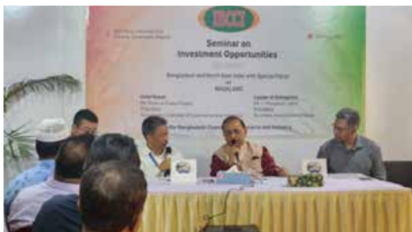
Photo: A seminar on Investment Opportunities between Bangladesh and North East India with Special Focus on Nagaland on 7th May 2023 at the admin building Sylhet Pulp and Paper Mills Ltd.