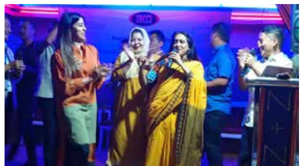
Photo: Cultural evening at the Nitol-Niloy Center participated by amateur artists of IBCCI and Nagaland.