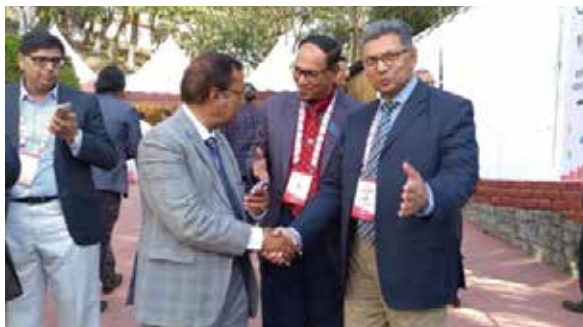
With the Honourable State Minister of Commerce and Industry of India in Mizoram H E Shri Som Parkash at the Mizoram University on 2 March 2023