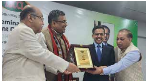
Photo: The Hon'ble High Commissioner of India to Bangladesh H.E. Mr. Pranay Verma is being greeted with Crest by the Hon'ble Minister of Industries.