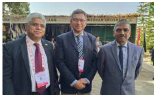
Secretary General of IBCCI with some Indian Delegates at the B20 India Initiatives in North East States of India 1-3 March 2023 at Aizawl, Mizoram.