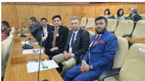
Photo: A cross-section of the participants of the B20 program in Gangtok, Sikkim, India.