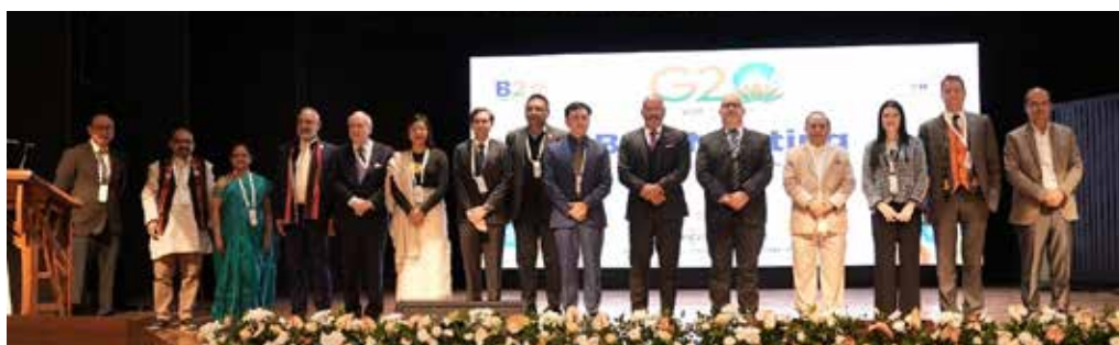
Photo: The Speakers of the Nagaland G20/B20 Conference are seen in a single frame which took place in the State Banquet Hall, Kohima, Nagaland on 5 April 2023