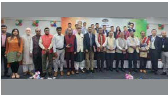
Photo: The visiting Nagaland Delegation is seen with the IBCCI President, Vice-Presidents, Board of Directors, and Members at the Pan Pacific Sonargaon on 8th May 2023..