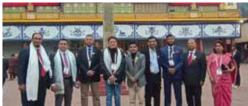
Photo: On a visit to the Rumtek Monastery with the participating foreign delegates on 16 March 2023 evening in Gangtok, Sikkim, India

We did participate in all the programs. The meeting was attended by more than 100 delegates including around 50 foreign delegates from 24 countries. In the meeting, the vibrant organic farming of the state was displayed prominently in front of the world through the B20 program. It also focused on exploring opportunities for cooperation in industries such as tourism, hospitality, and pharmaceuticals. Meanwhile, Sikkim Chief Minister H.E Mr. Prem Singh Tamang addressed the delegates participating in the conference. He appealed for support to establish Sikkim as the 'Greenest Agroecological Destination' in the world. He said that Sikkim needs such green technology which can ensure better production from limited agricultural land.