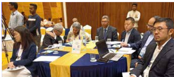
Photo: At the cluster session of the conference on 12 April 2023.

This conference aims to highlight the larger framework of cooperation between ongoing bilateral cooperation between India and Japan and Bangladesh and how that can be leveraged for cooperation to secure a prosperous Bay of Bengal Neighbourhood.