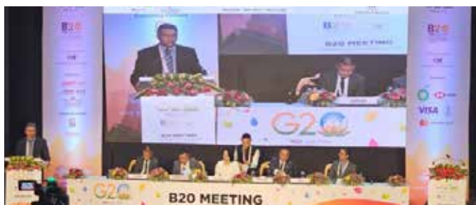
Photo: Secretary General of IBCCI speaking at the B20 Program in Mizoram.

was arranged at the Mizoram University Auditorium where the Honorable Chief Minister of Mizoram H.E. Shri Zoramthanga gave the keynote address. Among others the inaugural session was also addressed by the Honorable Minister of State of the Ministry of External Affairs, Government of India H.E. Dr. R K Ranjan Singh; Honorable Minister of State of the Ministry of Commerce and Industry Government of India, H.E. Shri Som Parkash.