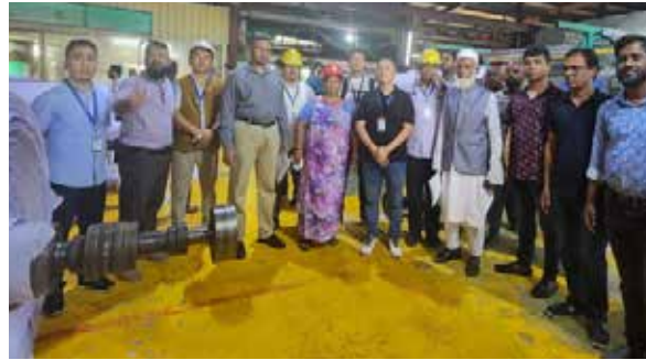
Photo: Nagaland Delegates and IBCCI officials are seen with the management of Sylhet Pulp and Paper Mills Ltd courtyard.