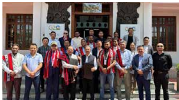
Photo: BAN and India-Bangladesh Chamber of Commerce & Industry sign MoU for mutual cooperation at Niathu Resort, Dimapur on 6th April 2023.