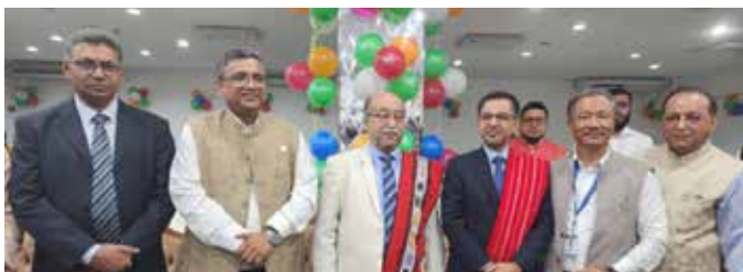
Photo: The Hon'ble Industry Minister, the Hon'ble High Commissioner of India are seen with the Leader of the Nagaland visiting delegation, President and Vice-President of IBCCI.