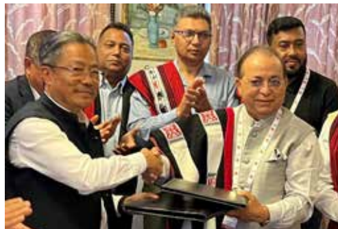
Photo: Exchange of MOU document with the President of Business Associations of Nagas (BAN) at Niathu Resort, Dimapur on 6th April 2023 Morning.