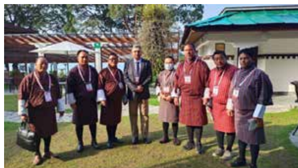
Photo: With the Bhutanese Business Delegations