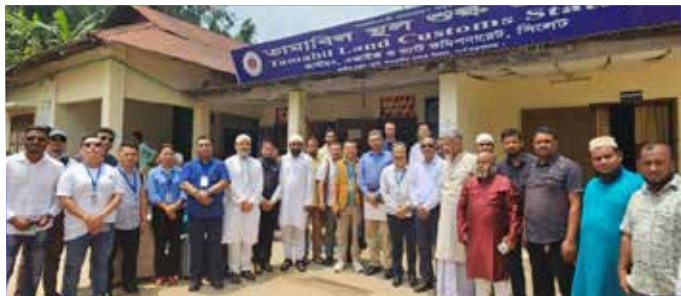
Photo: IBCCI officials and dignitaries of the Tamabil Limestone, Stone, and Coal Importers Group received the Nagaland Delegates at the Tamabil Check Post, Tamabil, Sylhet on 6th May 2023 at 11:00 AM.