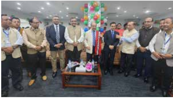
Photo: The Hon'ble Industry Minister, the Hon'ble High Commissioner of India are seen with the Nagaland Delegation, President and Vice-Presidents of IBCCI at Pan Pacific Sonargaon, Dhaka on 8th May 2023 evening.