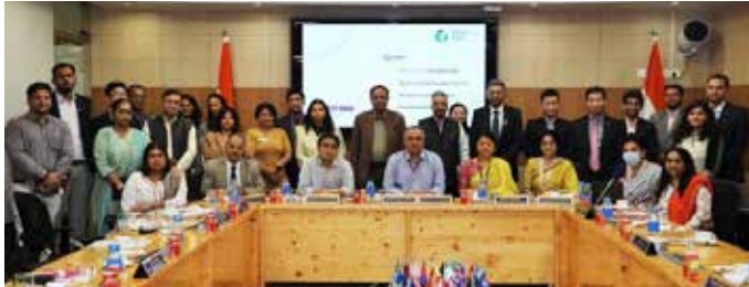
Photo: Photo Session with the Participants at The North East Global Investors Summit Roundtable Interaction on 20th April 2023 in Delhi.

and air routes have connected these states with New Delhi, reducing the distance between the Northeast and other parts of the country. Insurgency groups' economic blockades are a thing of the past, and peace prevails in Manipur and Assam. The region is also home to stunning tourist attractions, such as tea estates, hills, and pristine rivers, and has the potential to compete with the world's best. As India gains attention on the global stage, it is time to open up the northeastern states to the world.