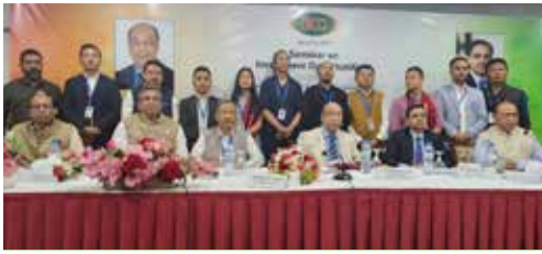
At the last leg of the visit of BAN Delegations, they held some B2Bs and visited some industries viz M K Sweaters and Lamiya Trading Ltd on 9th May 2023. Finally, the visiting Nagaland delegation left Dhaka on 10th May 2023 morning for Nagaland via Kolkata by Air taking with huge nice moments and good memories.