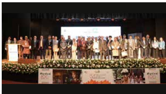
The Delegates of the Nagaland G20/B20 Conference are seen in a single frame which took place in the State Banquet Hall, Kohima, Nagaland on 5 April 2023.