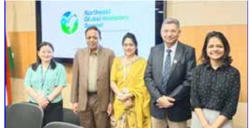
Photo: With the delegates of the Roundtable Discussion on North East Global Investors Summit 2023 at the Conference Room, Invest India, Vigyan Bhawan Annexe, New Delhi.