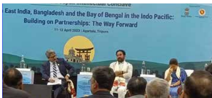
Photo: The Honorable State Minister of Ministry of Foreign Affairs, Government of People's Republic of Bangladesh H.E. Mr. Md. Shahriar Alam, M.P is speaking at the Third India-Japan Intellectual Dialogue

India, Shri. G Kishan Reddy, Hon. Minister, Ministry of Development of North Eastern Region, Culture and Tourism.