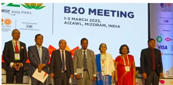
Photo: The Honorable CM is seen on the stage with other Ministers and Dignitaries.

On the 2nd day on March 2, 2023, the main program