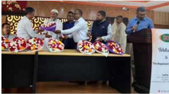
Photo: Nagaland Delegates were greeted with flower bouquets at the office of the Tamabil Limestone, Stone, and Coal Importers Group on 6th May 2023 at 11:30 AM.