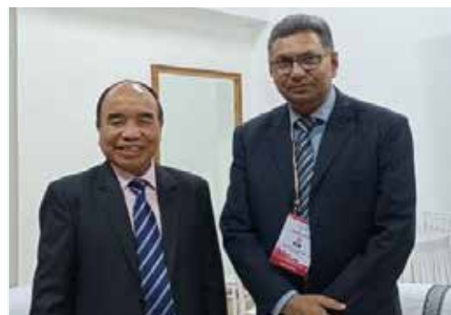
Photo: IBCCI Secretary-General is seen with the Honorable CM of Mizoram H.E. Shri Zoramthanga at the B20 Program in Mizoram

In the B2B session, the Mizoram delegates showed their keen interest to export bamboo chips, spices, horticulture products, mineral substances and medicinal plants. On the other hand, Bangladesh has the scope to export RMG, Toiletries, Sanitary wares, Processed food and plastic commodities (which is already in place there).