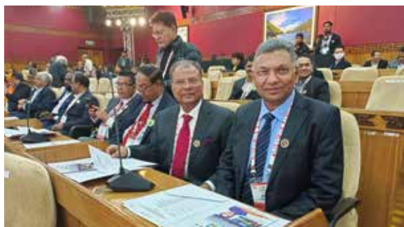
Photo: A cross section of the B20 participants