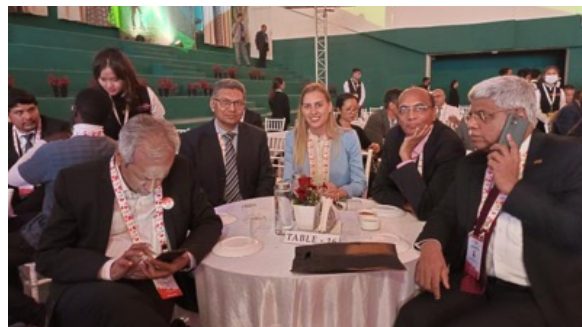
With the Chief Protocol Officer of Russian Embassy in India and other panelists at the Mizoram University campus on 2 March 2023 during Cultural Show and Dinner