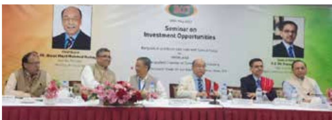
Photo: A seminar on Investment Opportunities between Bangladesh and North East India with Special Focus on Nagaland at Pan Pacific Soargaon, Dhaka on the 8th of May 2023 evening.

the geographical proximity between the two regions. Furthermore, he mentioned that his Delegates have signed 34 MoUs with Bangladeshi investors which reflects a great sign of huge collaboration and interest in terms of business between Nagaland and Bangladesh.