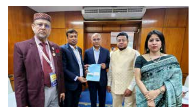
MOU signing at the BIMSTEC Energy Conclave in Dhaka at Pan Pacific Sonargaon