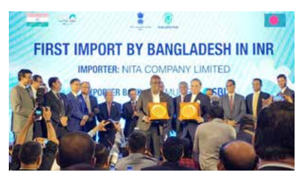
During the 'Launch of Trade in INR between Bangladesh and India' in Hotel Le Meridien, the First import was conducted through Nita Company Limited.