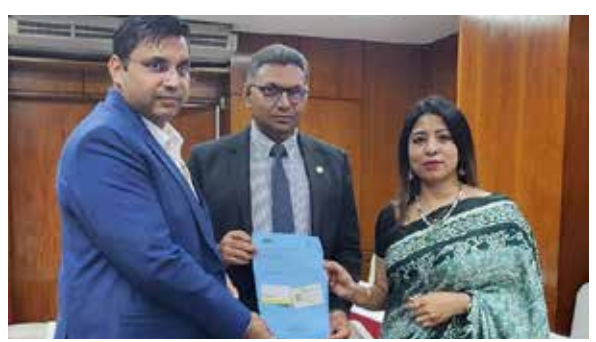
MOU signing at the BIMSTEC Energy Conclave in Dhaka at Pan Pacific Sonargaon