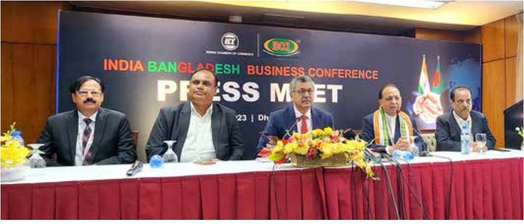
India Bangladesh Business Conference held on Sunday (6 August) in the Pan Pacific Sonargaon Dhaka Hotel.

Before the press conference, the opening session of the three-day long conference was held with the participation of delegates from the member countries