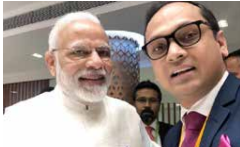
Salahuddin Yusuf with Prime Minister Narendra Modi

Along side the summit, Vibrant Gujarat Global Trade Show 2019 was also held from January 18 to 22. The exhibition venue was spread over 2,00,000 sq. meters having 2,000 stalls showcasing some 25 sectors like - Agro and food processing, automobiles and E-Mobility, banking and finance, chemicals