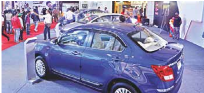
Vehicles are on display at the closing of "Indo-Bangla Automotive Show" at the Bashundhara International Convention City, Dhaka

He said that their sales growth was 18 to 20 percent over the last five years while their annual growth target was 30 percent.