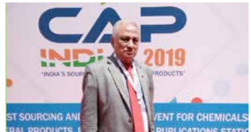
IBCCI Secretary & CEO at CAP India 2019 Mumbai

It is the largest Sourcing and Networking (Buyer-Seller meet) event for Chemicals, Plastics, Building &