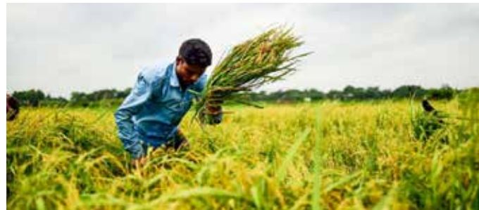
Bangladeshi farmers harvest rice in a field in Manikganj on the outskirts of Dhaka on August 27, 2018.

The CEBR predicts that three of the top five global