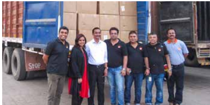
Officials of Expo Freight Limited standing in front of the bonded, cross-border, land-air transshipment

EFL is considering this breakthrough to be instrumental in positively impacting business growth beyond borders. (Courtesy: The Bangladesh Monitor; Dated: 16-31 January, 2019)