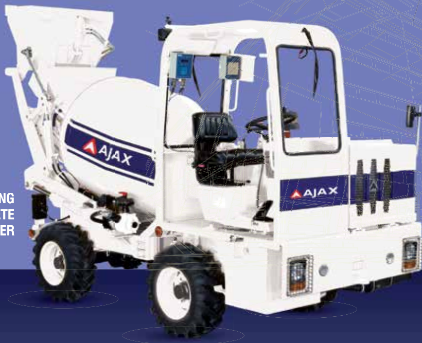
SELF-LOADING CONCRETE MIXER

CONCRETING SPECIALIST: DRIVEN BY TECHNOLOGY