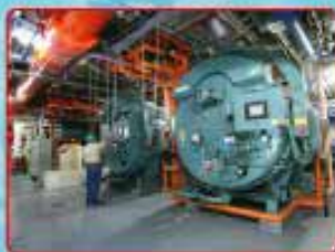
Boiler water Treatment