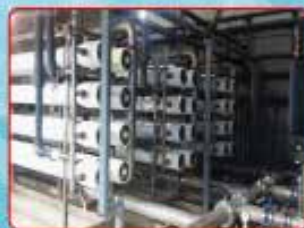
Reverse Osmosis Plant