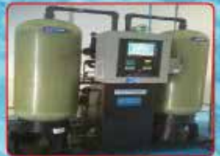
Indion Swift DM Plant