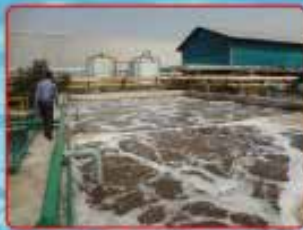
Effluent Treatment Plant