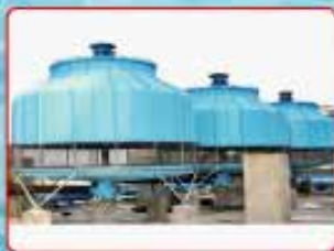
Cooling Water Treatment