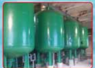
Iron Removal Plant