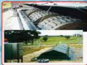
Packaged sewage Treatment Plant For Hospital/Residential Complex