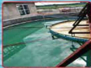
High Rate Solids Contact Clarifier