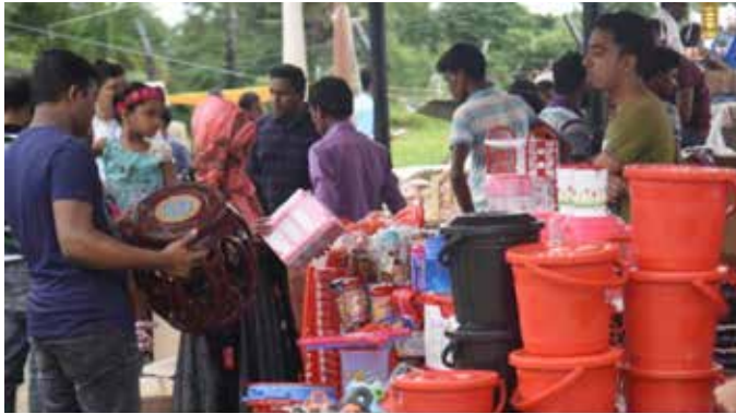
People check plastic products at a border haat in Mokamia, Feni.

of the government, for the second ICP project, to be directly monitored by Prime Minister's Office for