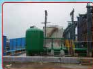
Filtration for Cooling Tower Make up