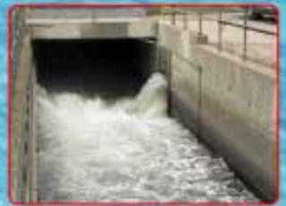
Waste water treatment & water recycling plant