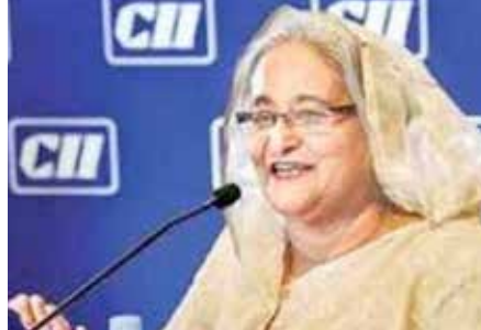
Prime Minister Sheikh Hasina addressing leading businessmen of India at ITC Maurya hotel in New Delhi

The volume of trade between two countries is nearly 10 billion dollars, she said.