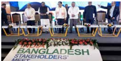
Assam Chief Minister & Bangladesh Commerce Minister at inaugural session

Union Minister for State for Road Transport and Highways V K Singh said India striving for a 5-trillion dollar economy would certainly benefit Bangladesh and Myanmar. He said India and Bangladesh must work for their mutual benefit. Mr Singh said that connectivity must be improved to get the maximum benefits from the Act East Policy. The Minister said the proposed multi-modal hub at Joghicha in Assam would certainly benefit the region