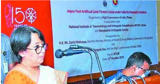
Indian High Commissioner to Bangladesh Sreemoti Riva Ganguly Das spoke at a program in the city on October 10 at National Institute of Traumatology and Orthopedic Rehabilitation (NITOR).

Indian High Commissioner to Bangladesh Riva Ganguly Das has said that India attaches highest