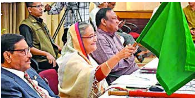
Prime Minister Sheikh Hasina inaugurating the 'Kurigram Express Train' through videoconferencing at her official residence Ganabhaban in the city on Wednesday.

The train links between India and Bangladesh that were closed after the 1965 India-Pakistan war will reopen, Prime Minister Sheikh Hasina has said.