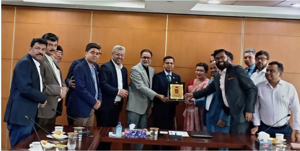
Photo: IBCCI delegation presents a commemorative crest to H.E. Mr. Pranay Kumar Verma during the courtesy call.

he encouraged the organization of seminars, workshops, and bilateral meetings between leading industries of both nations. He also underscored the importance of expanding Bangladesh's export basket and suggested increasing export volume from USD 2 billion to USD 4 billion.