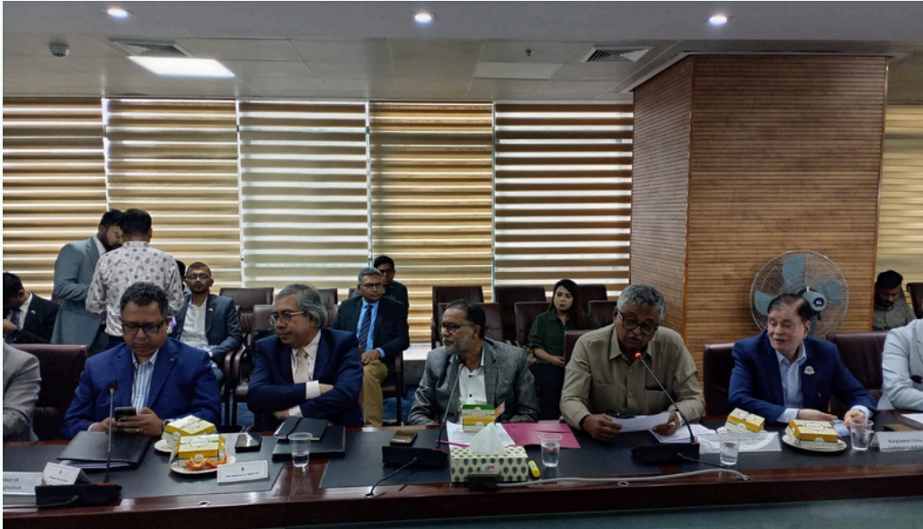
Photo: The Pre-Budget Discussion meeting with NBR is in progress

04. Introduce a refund system at Benapole Port, similar to other ports, and ensure disposal within 30 days.