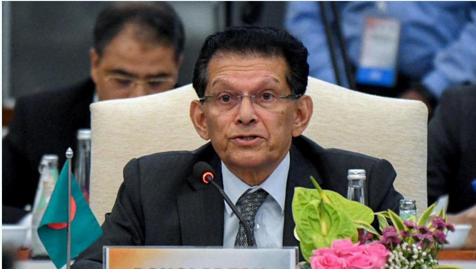
Photo: Bangladesh Foreign Minister Khalilur Rahman sharing his vision

Visit likely on April 7 and 8; first FM visit since fall of Hasina regime; newly elected BNP indicates more willingness to negotiate Ganga water sharing treaty renewal, compared to the interim government